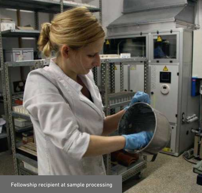
Fellowship recipient at sample processing