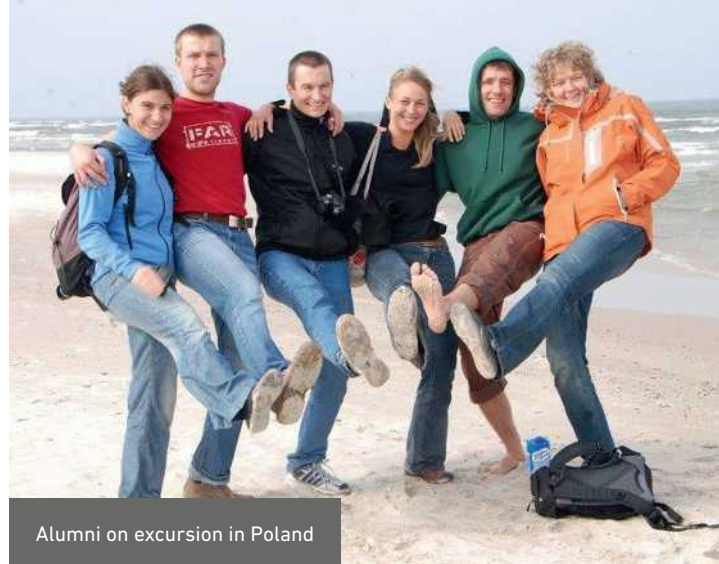
Alumni on excursion in Poland