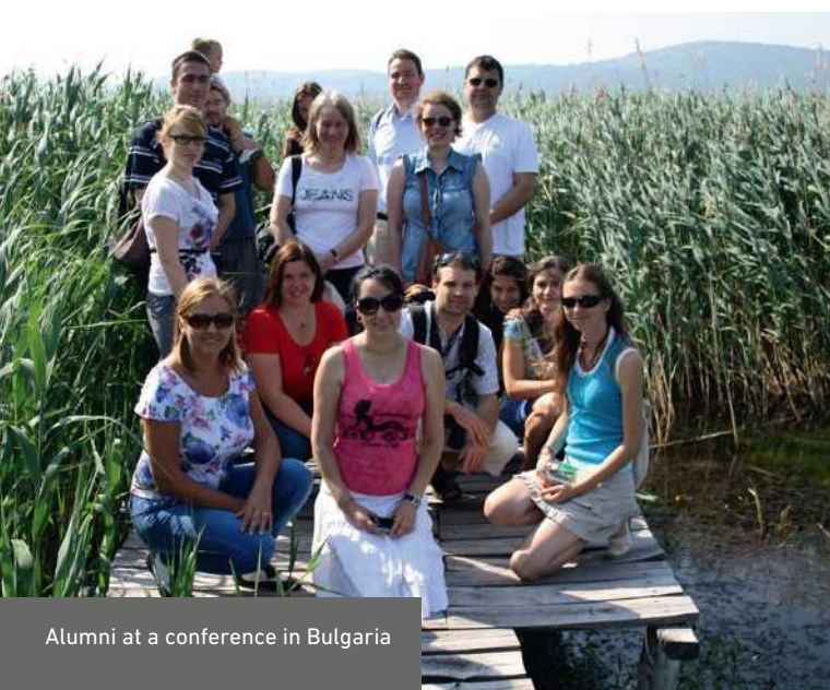
Alumni at a conference in Bulgaria

DBU coaches its fellows during the whole stay. During seminars the fellowship recipients can present their topics and their results and network with each other. Furthermore, DBU welcomes and supports individual initiatives to organize further professional events and seminars.