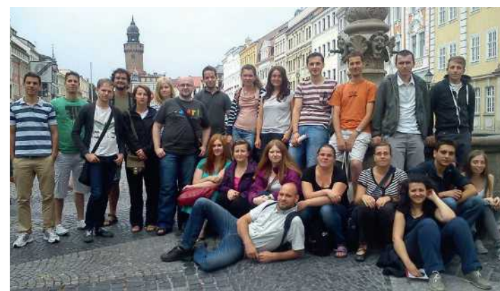
Fellowship recipients during a city tour